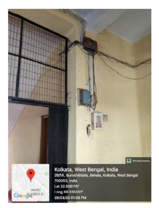
Sahapur Mathuranath Vidyapith (HS)